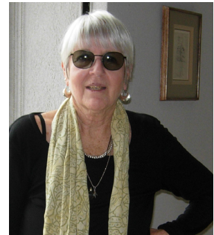
Joanne Kyger

A prominent American poet for more than 40 years, Kyger is the author of over 20 books and has been an inspiration to countless writers. Associated early in her career with Beat literature, she is a colleague of many naturalists and environmental activists. She lives near San Francisco and teaches often at the Jack Kerouac School, Naropa University in Boulder.