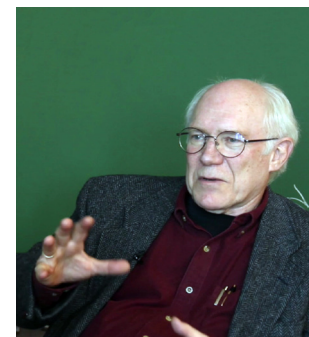
Robert Bringhurst

Poet, translator, typographer, cultural historian, and linguist, Robert Bringhurst's books on Haida mythology and storytelling have placed him among the leading public intellectuals in North America. He has published over a dozen books of poetry and the acclaimed prose works The Tree of Meaning: Language, Mind and Ecology and Everywhere Being Is Dancing: Twenty Pieces of Thinking . He lives on Quadra Island, B.C.