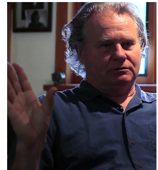
Wade Davis

A scientist and advocate for bio-cultural diversity, Wade Davis has been explorer-in-residence at the National Geographic Society in Washington, D.C. and frequently presents documentary specials on public television. A renowned ethnographer, he holds a PhD from Harvard and is the author of nine books. He recently joined University of B.C. as a professor of anthropology and is based there at the Liu Institute for Global Issues.